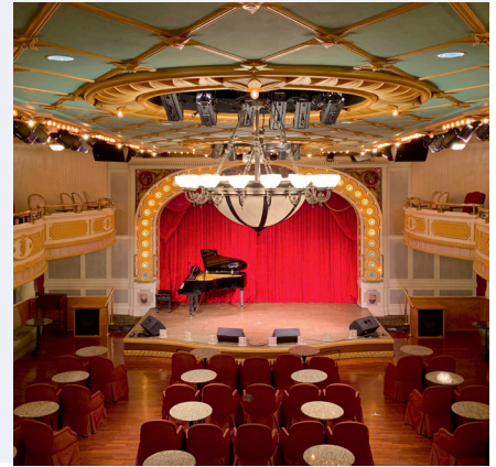
Take in World-Class Entertainment in the Grand Saloon