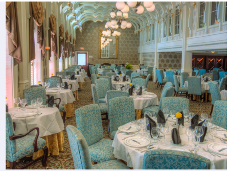
Dine in the Lovely J. M. White Dining Room

T his premier experience features included shore excursions in every port of call, complimentary wine and beer with shipboard dinners featuring regional cuisine utilizing fresh ingredients creatively combined with a contemporary flair, daily Riverlorian lectures onboard, expert Broadway caliber entertainment every evening — including featured guest performances by sensational local artists, deluxe private veranda staterooms with dramatic views.