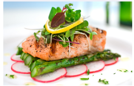
Enjoy Gourmet Meals Aboard the Ship